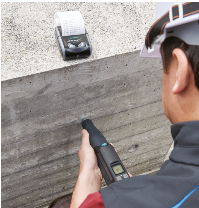
Original Schmidt Live Print with Bluetooth printer

Free up your staff to be more productive and get more satisfaction from a once-laborious task; and get your testing done quickly, automatically, and free of human error.