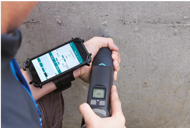
Original Schmidt Live with iOS app