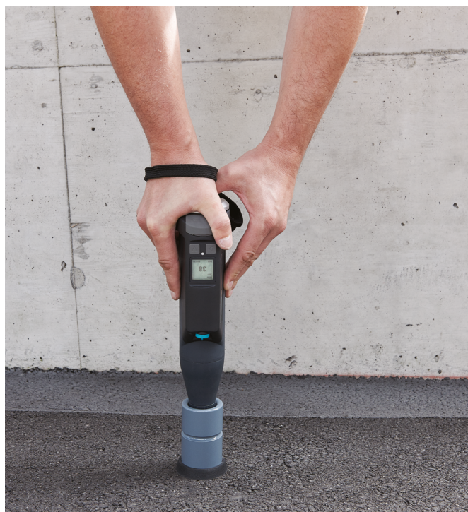
Original Schmidt Live with portable testing anvil